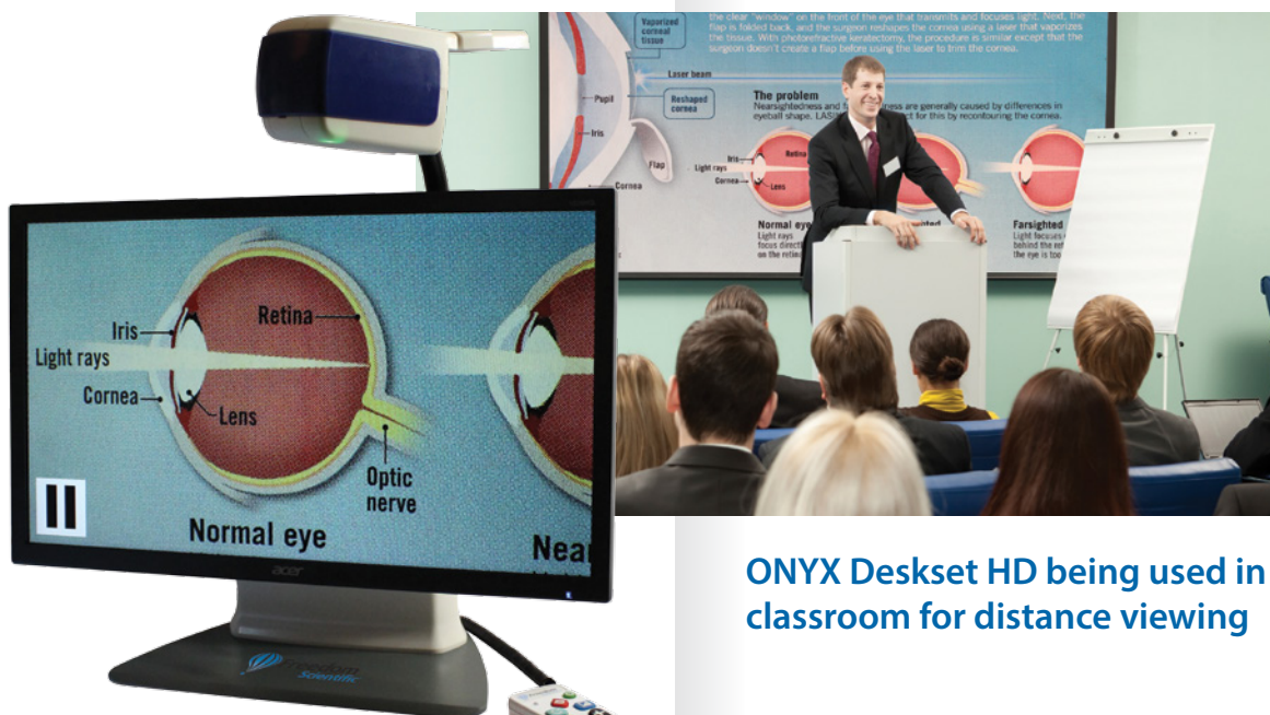
ONYX Deskset HD being used in classroom for distance viewing

zoom level but self-viewing to a small amount of magnification. The ONYX Deskset HD remembers each setting and automatically switches to your preferred settings when you aim the camera.